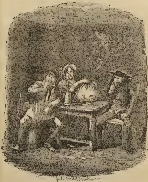
THE JEW AND MORRIS BOLTER BEGIN TO UNDERSTAND EACH OTHER.